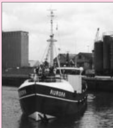
Women on Waves' Aurora sails into Ireland to provide reproductive health care to Irish women.

Women on Waves , in cooperation with local Irish groups, was smashingly successful in raising public awareness of the consequences of the oppressive Irish law. There was extensive media coverage all over the world, educating people about