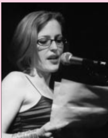
FMF Board Member Dolores Huerta and X-Files star Gillian Anderson lead the Million4ROE campaign.