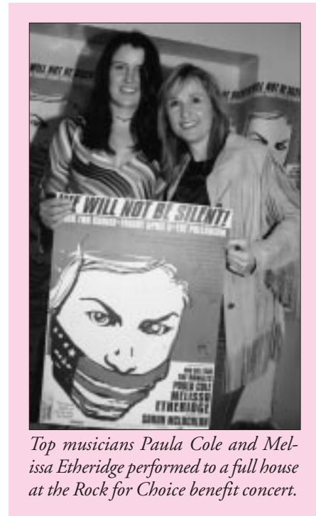
Top musicians Paula Cole and Melissa Etheridge performed to a full house at the Rock for Choice benefit concert.

Many celebrities, including Ellen DeGeneres, Kathy Najimy, Helen Hunt and Portia de Rossi, joined the crowd and cheered in support of every mention of protecting women’s rights and abortion rights. “Thank you for helping all women be able to make a choice!” said Paula Cole. “It seems absolutely bloody ridicu-